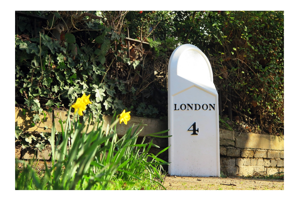
Figure 4. The milepost as seen by traffic approaching from the north, January 2018.